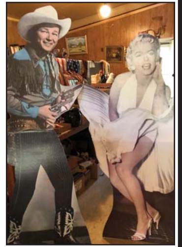
STAND-UPS Marilyn Monroe Roy Rogers